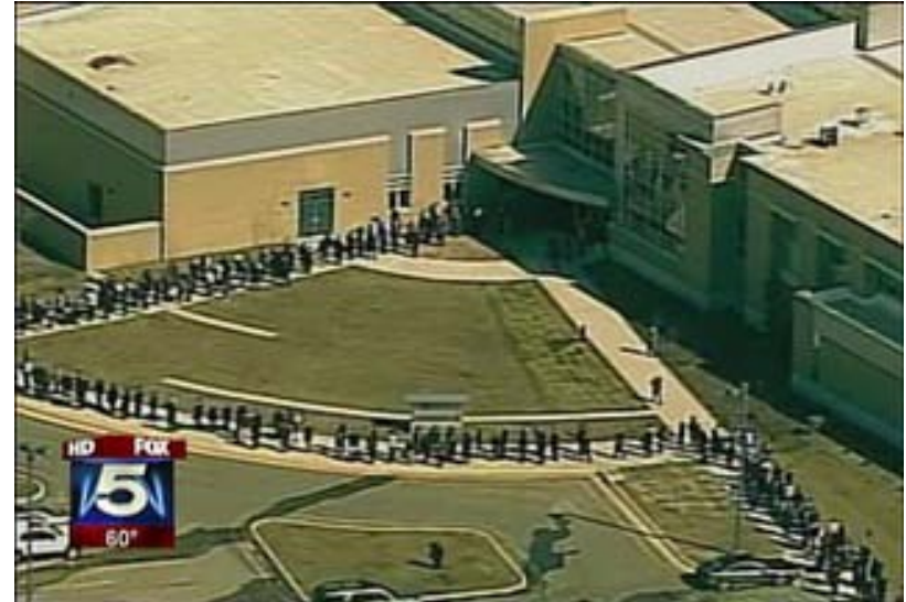
Crowded Job Fair