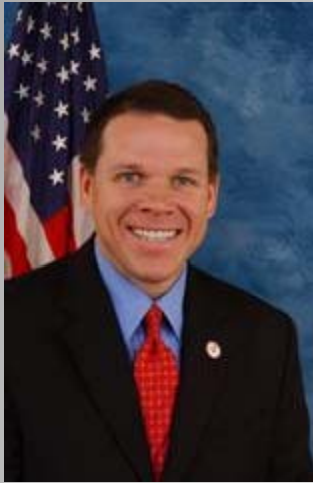
Rep. Sam Graves (R-MO)