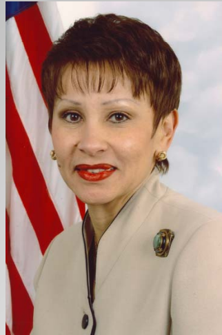
Nydia M. Velazquez (D-NY)