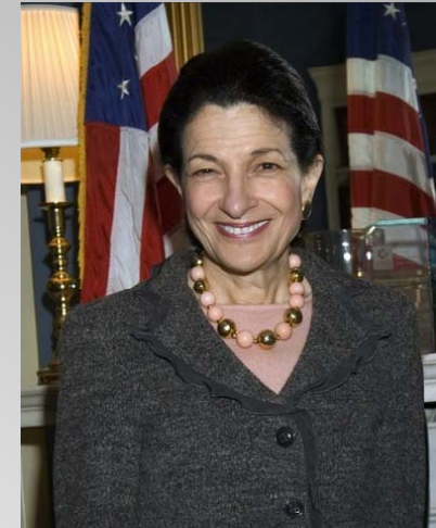
Sen. Olympia Snowe (R-ME)