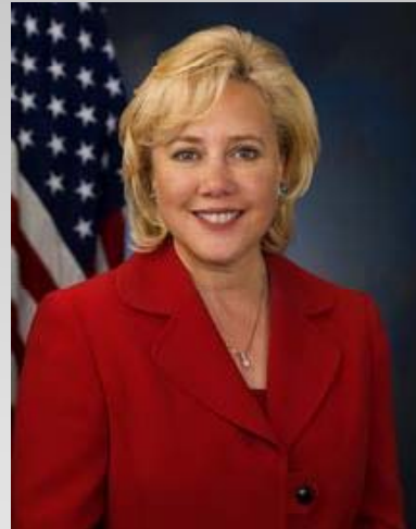
Sen. Mary Landrieu (D-LA)